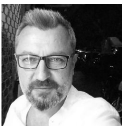
TECH. INFRASTRUCTURE Electro Bug-gy